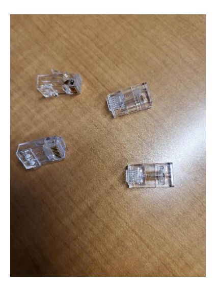
Figure 2: RJ45 connectors

T568A or T568B – The order of the wires inside the RJ45 connector is determined by one of two standards (T568A or T568B). A straight-through (or patch) cable will use the same wiring methods on both ends. In the US, most straight-through cables use T568B. If you are building a crossover cable, you would use T568A on one end and T568B on the other end. Make sure you know if your location has a standard wiring method that they use.